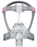
62128 Mirage FX for Her