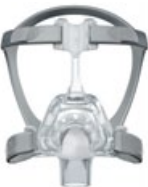
62118 Mirage FX Wide