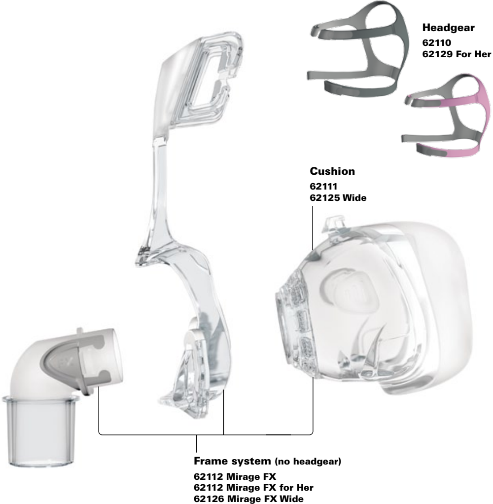
Headgear 62110 62129 For Her